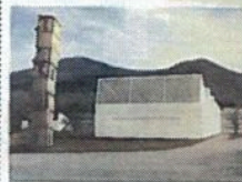
Runway dream: Thomas Krens (below) aims to open a museum in the grounds of an airport