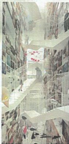
Renderings of the exterior (top) and interior of the Boijmans Museum's planned Public Art Depot